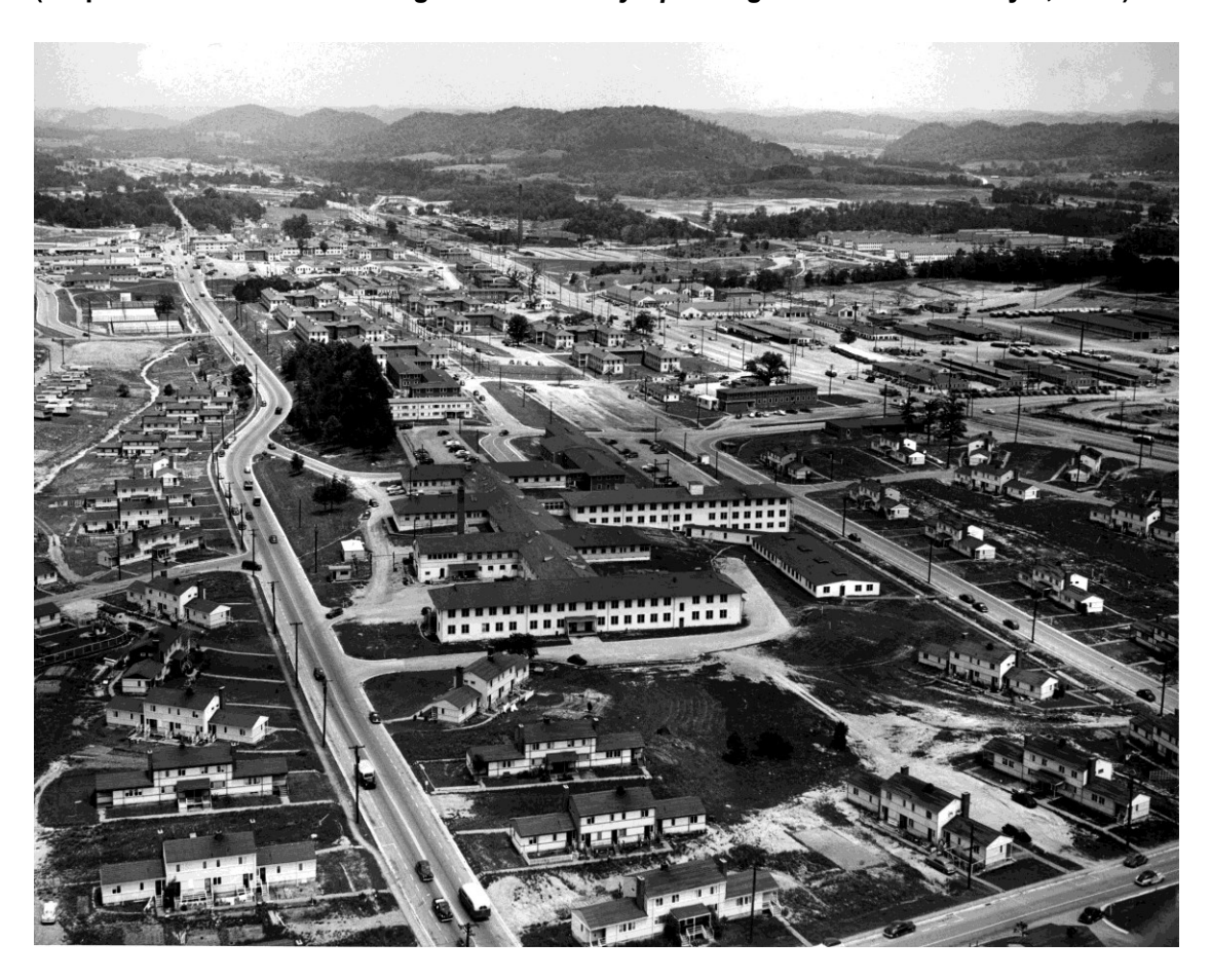
View of Oak Ridge Hospital looking east with Castle on the Hill and steam plant across the Oak Ridge Turnpike and in the background

(As published in The Oak Ridger's Historically Speaking column on January 4, 2016)